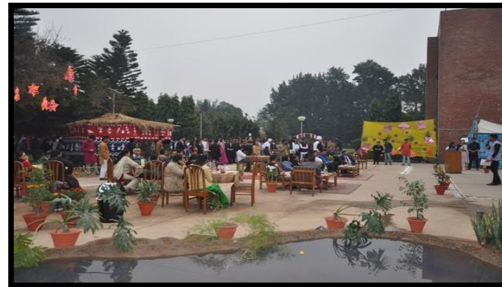
2. SEATING AMONG THE RECREATION OF LOCAL LANDSCAPE