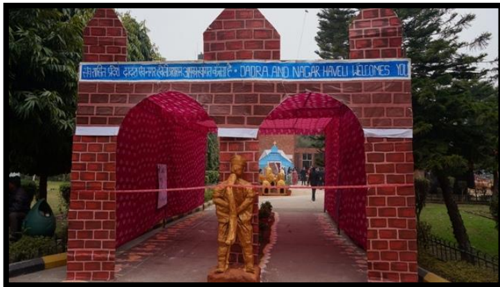
1. ENTRY GATE TO THE VENUE