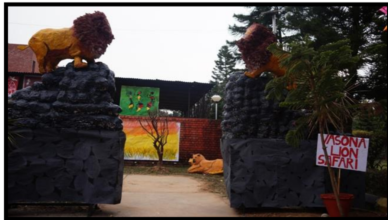
CULTURAL PROGRAMME, LOCAL FLORA AND FAUNA